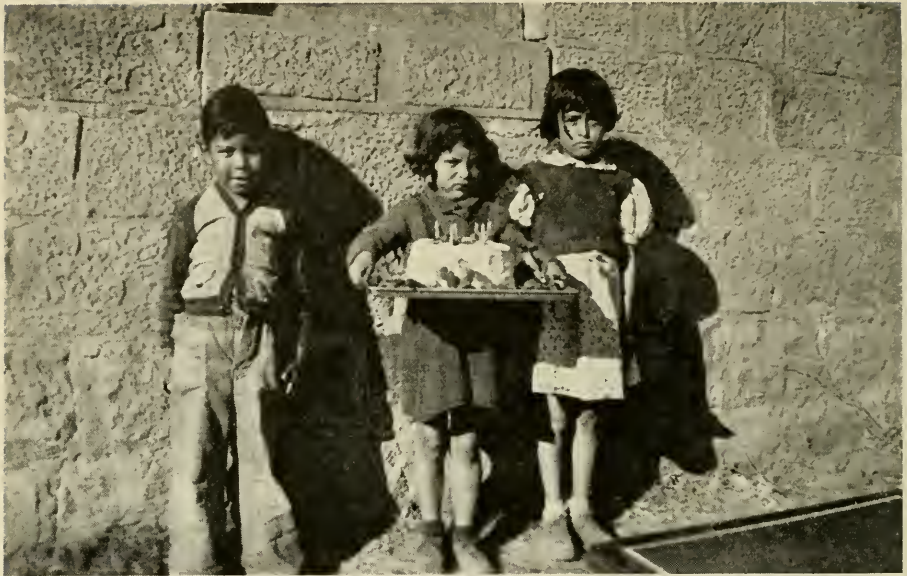
Birthdays are a serious business for the kindergartners at Alpine, Texas